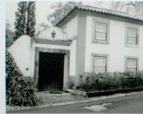
1988 - 1991 Rua do Zaire, 17 - 1ª Drt. Lisboa, Portugal