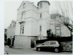
1988 - 1991 Rua do Zaire, 17 - 1ª Drt. Lisboa, Portugal