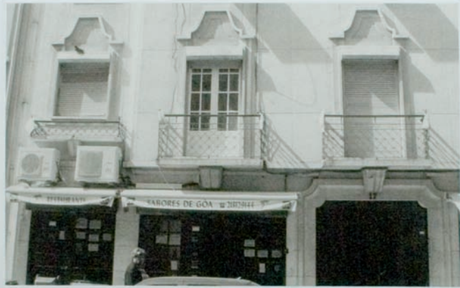
1950 Rua do Zaire, 17 - 1ª Drt. Lisboa, Portugal